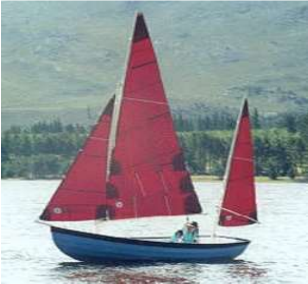
Not ours but similar when restored

Restoration started on the Petit Brise in WS 2